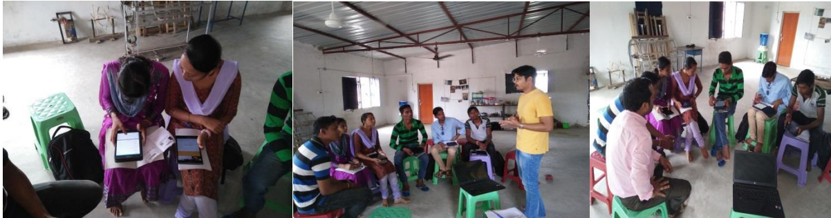
2.3- After the center visit we organized combined meeting of SPs where we discussed about enhance the service basket and connect more peoples with scheme and other services.